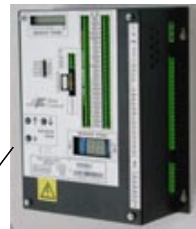
LIFT CONTROL SYSTEM VTA971