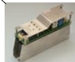
BACKUP POWER SUPPLY ZZ20