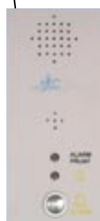
SPEAKER PHONE