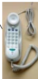
PHONE IN THE MACHINE ROOM