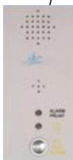
SPEAKER PHONE